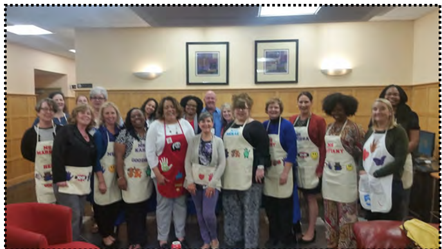
North Carolina Healthy Social Behaviors Team sporting their own greeter aprons!